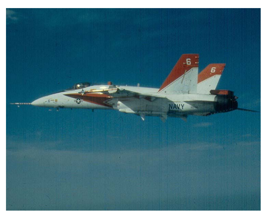
F/A-18E/F SPIN TESTING